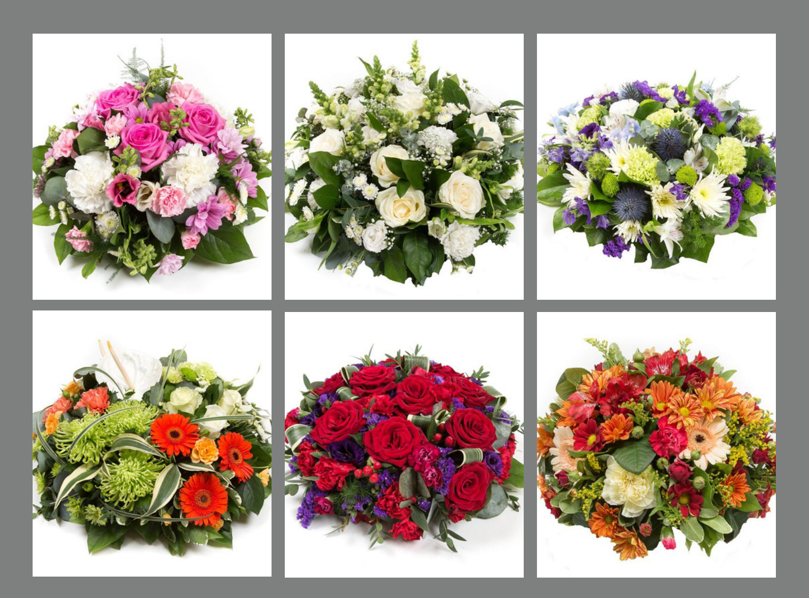
Our Elegant and delicate floral posies are the perfect choice for sending your condolences or love to a friend or family member. Each posy is crafted with soft fresh flowers and created with your loved one in mind.